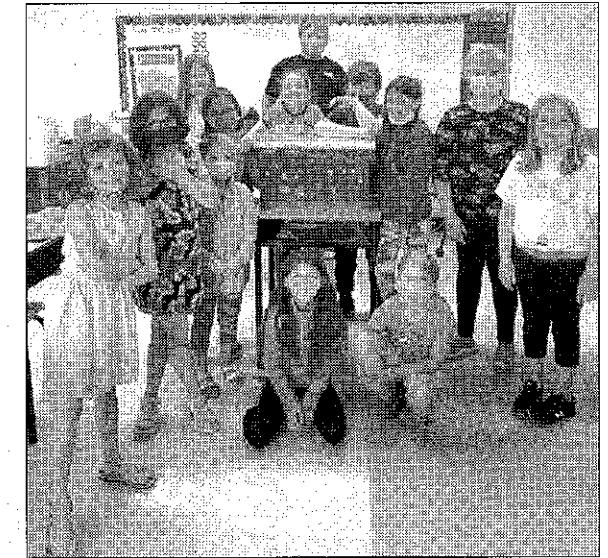
Students in Ms. Hookey's class at Catalina Elementary proudly display the beehive they decorated.