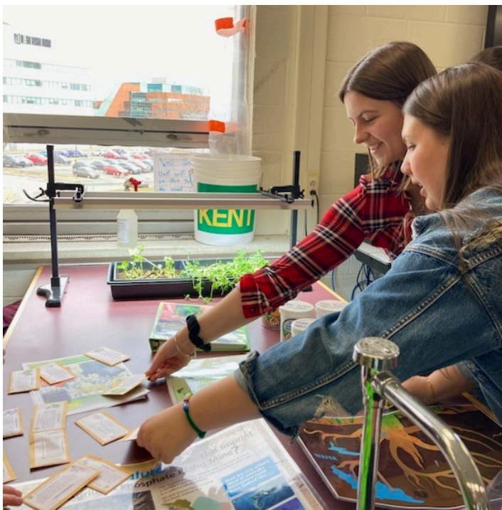
MUN'S PRE-SERVICE TEACHERS REVIEWING AITC-NL'S RESOURCES