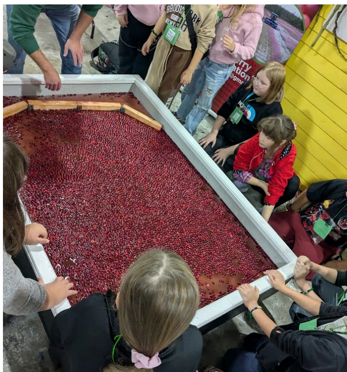
CRANBERRY EXHIBIT AT THE AGRICULTURE EXPO AMAZING AGRICULTURE ADVENTURE